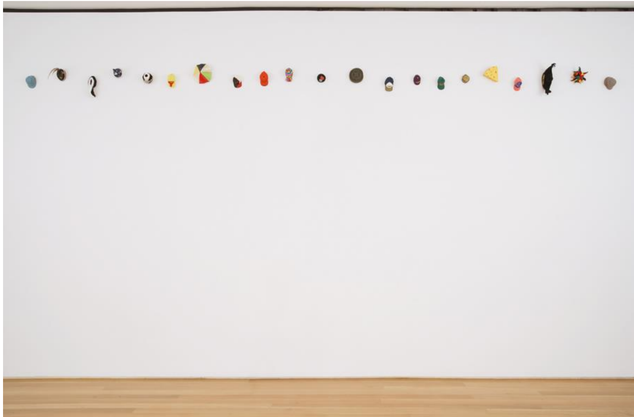
Charles LeDray, Village People , 2003–06, Collection of John and Amy Phelan

title of the Whitney retrospective). These 588 tiny handmade objects were originally displayed in 23 groupings on a pre-gentrification Astor Place sidewalk, right beside the normal-sized collections of motley goods peddled on blankets and cardboard by the homeless and destitute. The miniaturization of LeDray's imitation porno magazines, battered suitcases and other assorted debris is a reflection of the small social status of marginalized people reduced to selling what others have discarded. Ledray's miniature cast-off garments evoke a sense of mourning, and the lives and deaths implied by heterogeneous absent bodies.