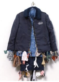
Charles LeDray, Charles , 1995, Collection of Barbara and Leonard Kaban

The fetishism of uniforms hiding a multiplicity of schizophrenic fashion is similarly outlined in Charles (1995), a plain little black jacket with Ledray's first name embroidered on the front, hanging on a tiny hook over a pair of black pants and a work shirt. At least 20 really tiny garments -- outfits for doll's dolls -- dangle below, like a virus of inner turmoil, including a silk lamé bra, a pink fool's cap and a pink gingham bathrobe. More toxic diversity is found in three enormous groups of tiny porcelain vases displayed in glass cases, respectively glazed white, multicolored and black -- probably totaling at least 10,000, none alike. The sheer variety of forms cancels their singular